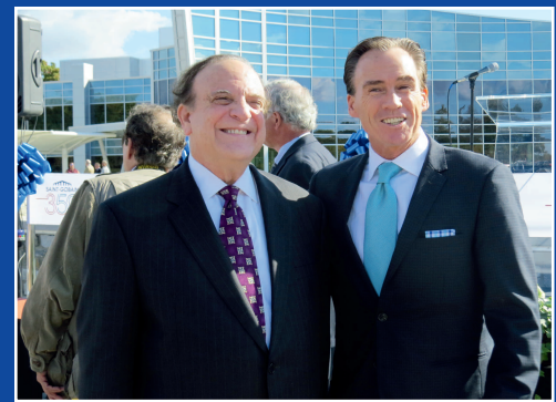
Senator Dinniman and Lt. Governor Mike Stack at the opening of the North American Headquarters of Saint-Gobain and CertainTeed Corporation in East Whiteland.

■ Equine Agriculture – Horses continue to be an essential and defining aspect of Chester County. When we think of horses and Chester County, we think of champion racehorses like Smarty Jones, Olympic-caliber athletes, premier equestrian events for riding, jumping, showing and dressage, and equine therapy programs for those with disabilities. But the horse industry also serves as both a driving force for open space preservation and an economic engine that generates tens of millions of dollars in revenue in areas that represent some of the last bastions of rural open space in the region. This