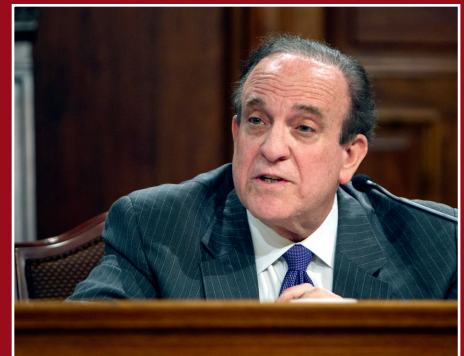
Senator Dinniman hears testimony on education funding at a meeting of the Senate Education Committee.

■ Anti-Hazing Law – Senator Dinniman led the passage of this bill, which expands Pennsylvania’s anti-hazing law to protect student athletes and young people in public and private high schools. Previously, the anti-hazing law only applied to colleges and universities. The law establishes the crime of hazing as a third-degree misdemeanor and requires high schools to establish anti-hazing policies, rules, and penalties for violations.