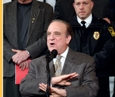
Senator Dinniman speaks about public safety alongside state and local police officials in Harrisburg.